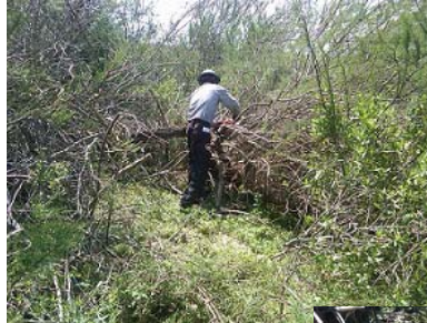
Chainsaw operator entering a dog-hair stand of salt cedar to expose the stump.

proach to eradicating salt cedar is systematic and often labor intensive. Currently the refuge is using crews to cut the trees