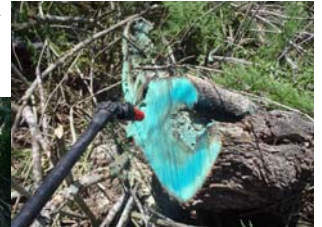
The stumps are sprayed with herbicide which is carried down to the roots and kills the tree.