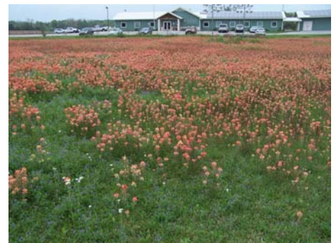
Indian paintbrush in front of Complex Office.

Indian paintbrush are hemiparasitic, primarily on grasses. The paintbrush seedling's roots will grow until they touch the roots of another plant; penetrating these host roots, the paintbrush will obtain a portion of their nutrients from the host plant. For this reason, it cannot be easily transplanted.