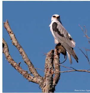
White-tailed kites are commonly seen during the CBC at San Bernard.

This year the San Bernard CBC was Friday, December 17. The count area